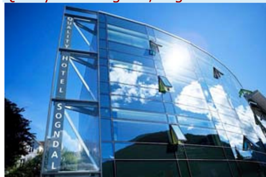
Quality Hotel Sogndal, Sogndal

This superior tourist class hotel is located in the heart of Sogndal, only minutes from Sogneford, the world's largest fjord with magnificent natural beauty.